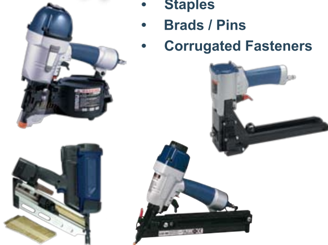
Cordless range of tools available via Gas or Battery